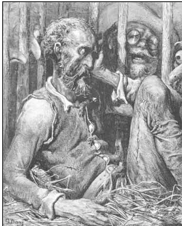
Grabado: Gustave Doré “Don Quijote enjaulado” (c. 1860)