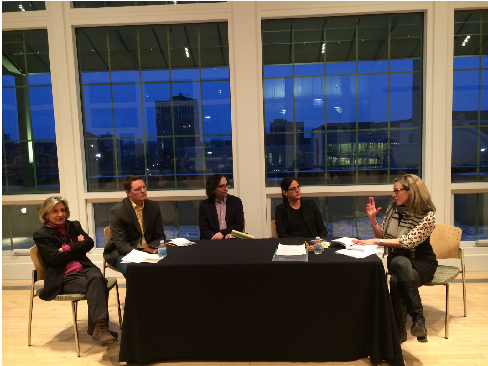
Faculty Round Table